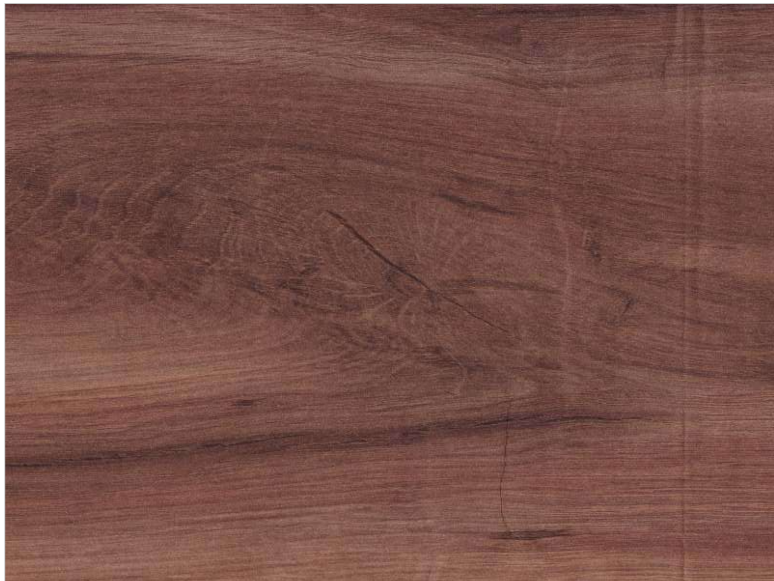
Hash Brown Teak (CT)

MIDAS Premium Collection HDF LAMINATED FLOORING AC-4 8mm