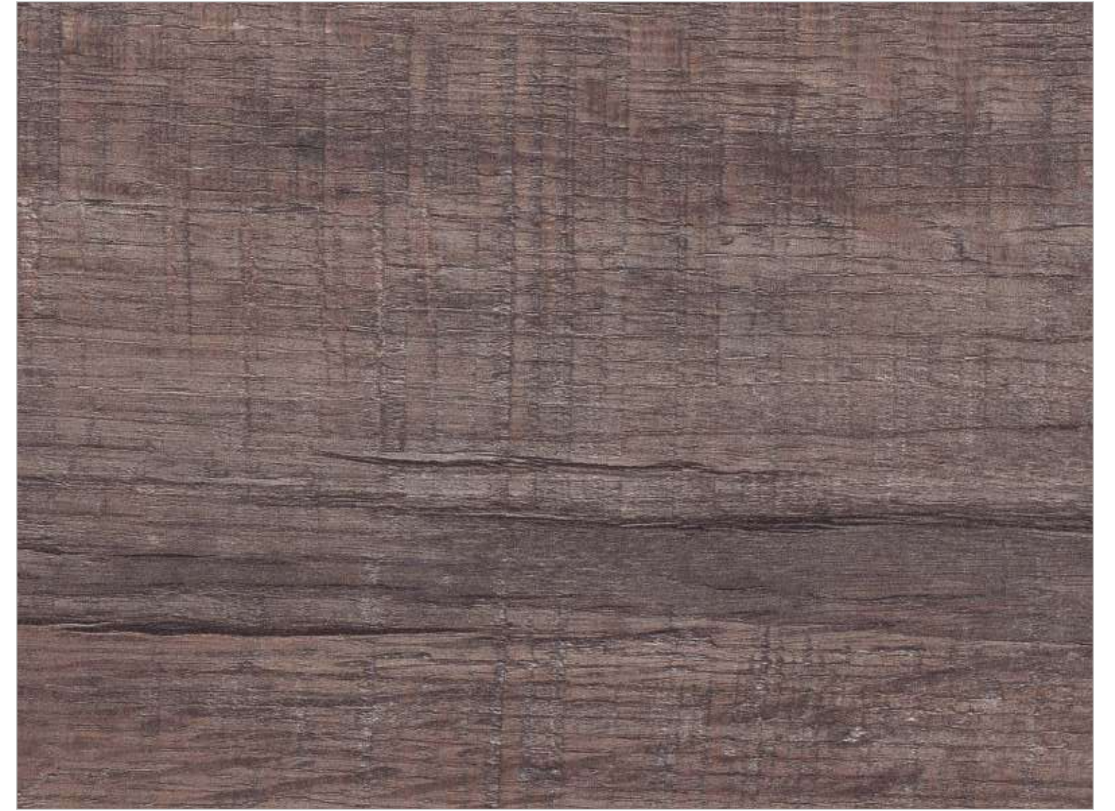
Natural Burn Wood (CT)