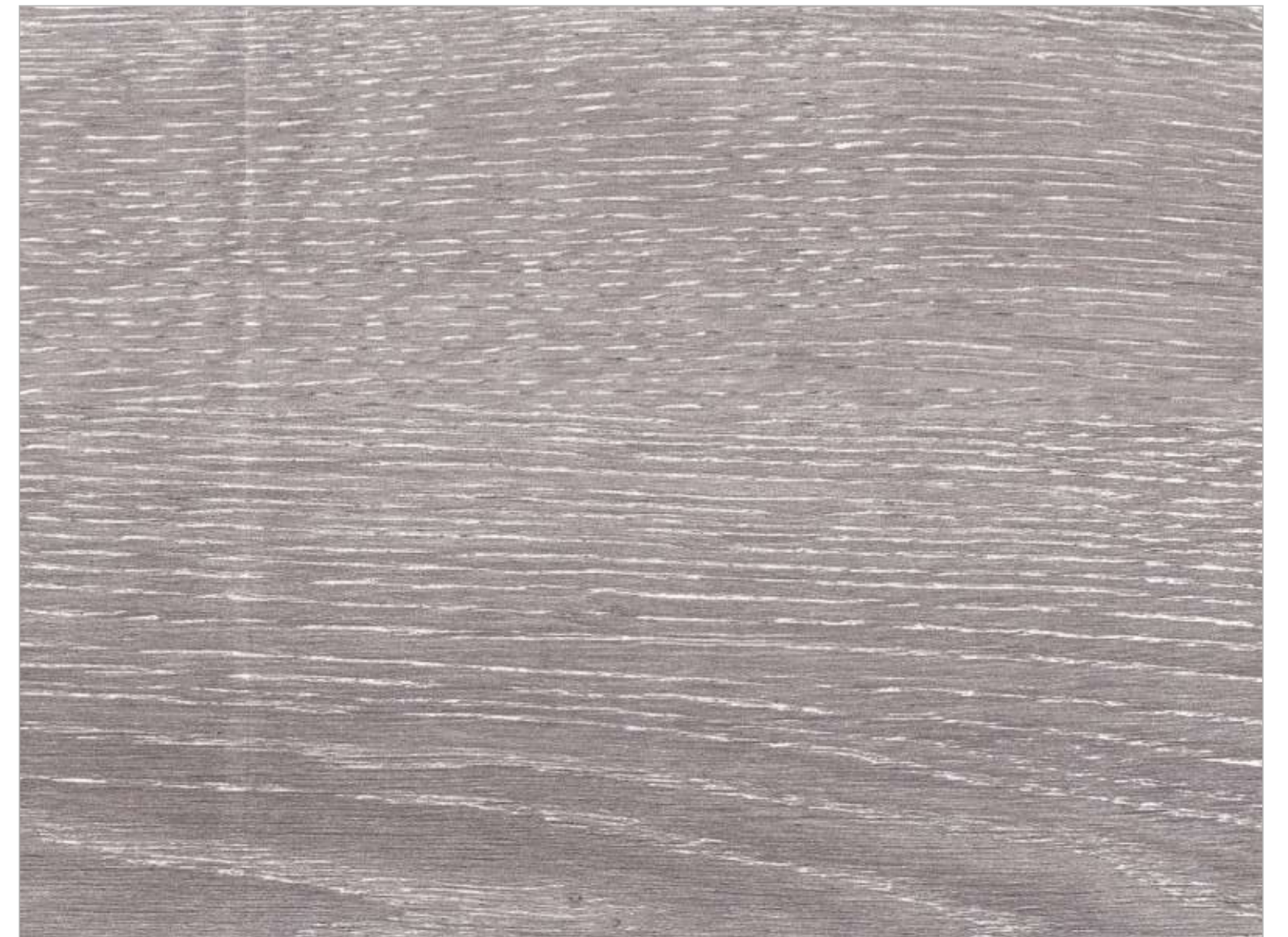
Fossil Grey Walnut (CT)

MIDAS Premium Collection HDF LAMINATED FLOORING AC-4 8mm