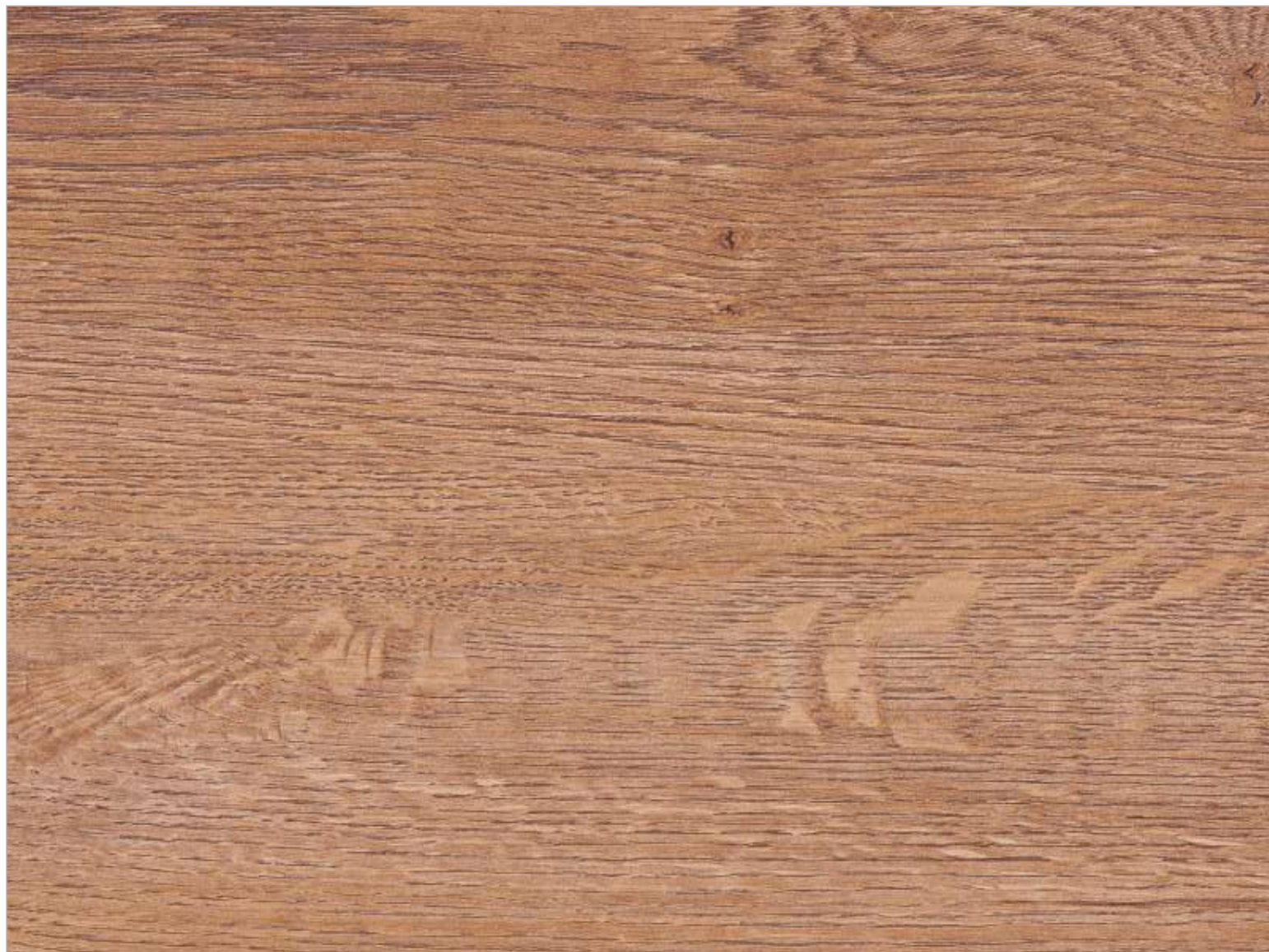
Russet Brown Teak (CT)

MIDAS Premium Collection HDF LAMINATED FLOORING AC-4 8mm