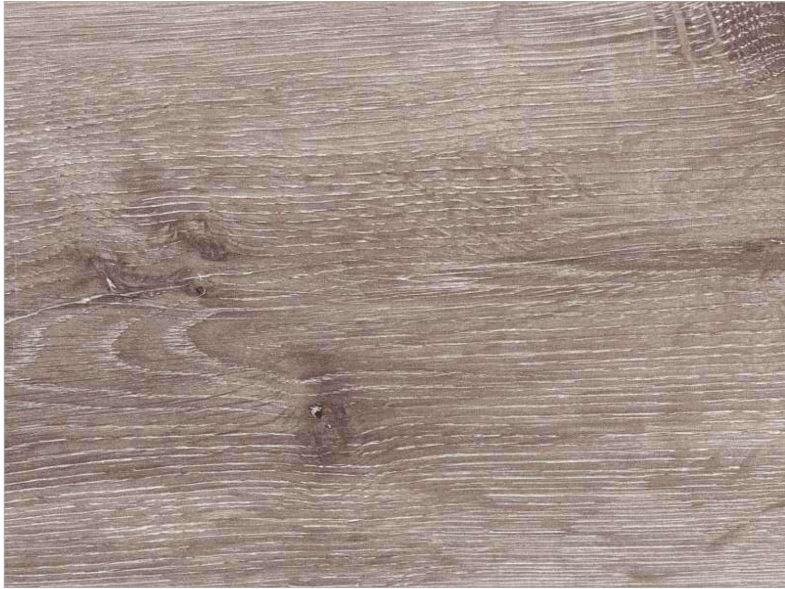
Magical Oak (CT)