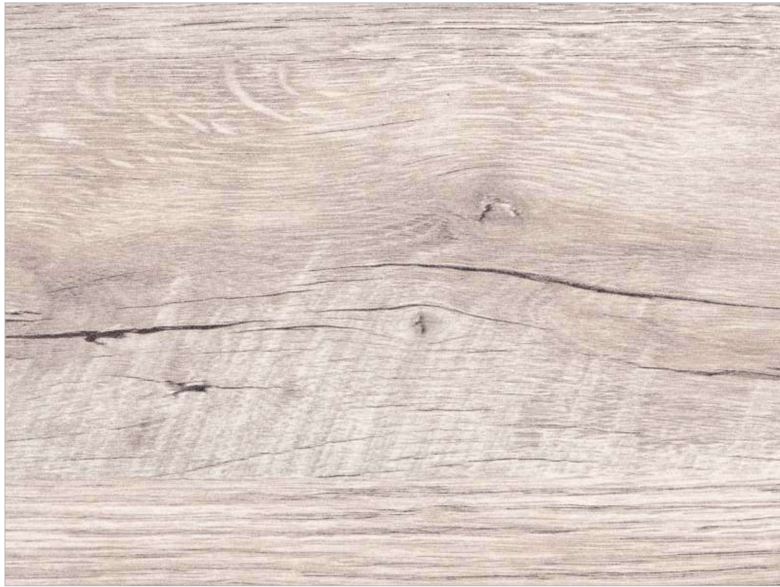
White Wood Ruff (CT)