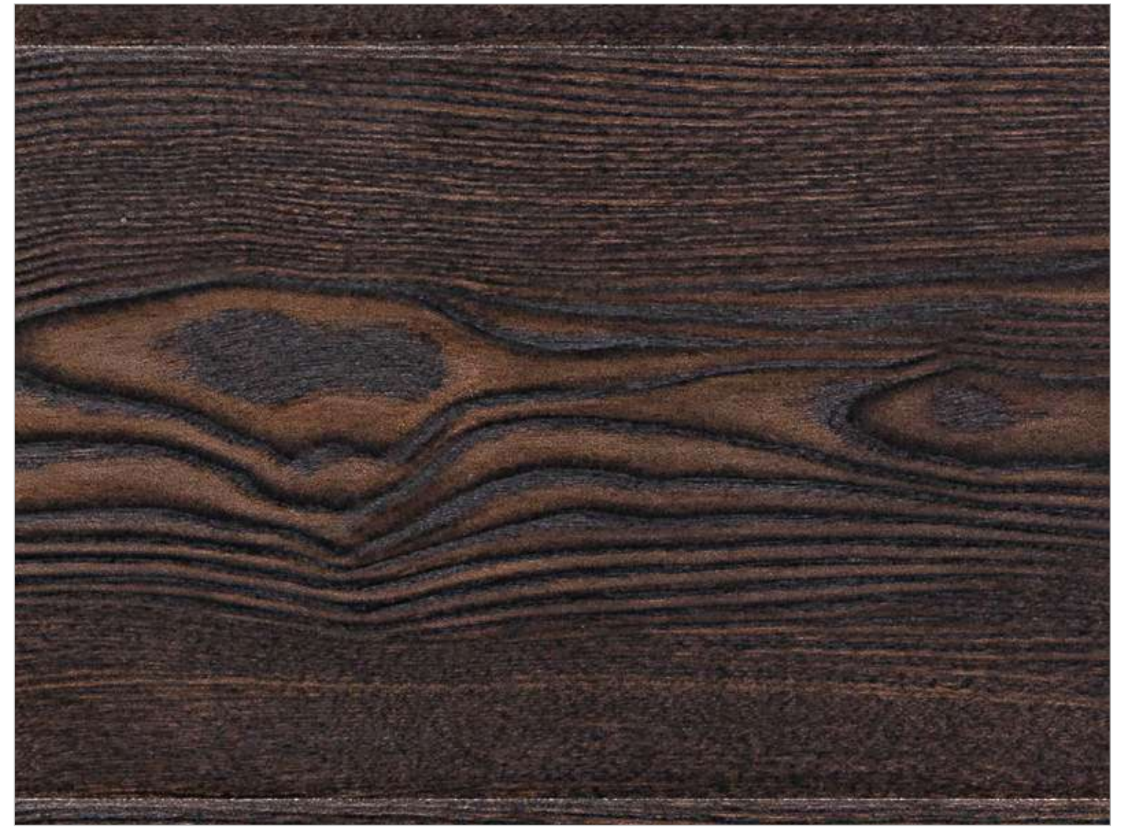
Dark Venis (SE)