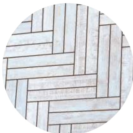
HERRINGBONE - 2P -WEAVE ( 3580, 3573 )