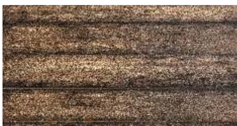
Harvest Chest (DD) Code: 3585