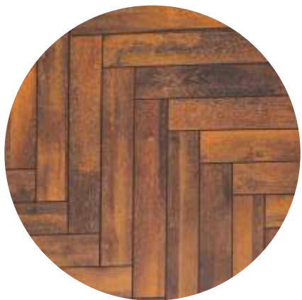
HERRINGBONE (1P) ( 3579 )