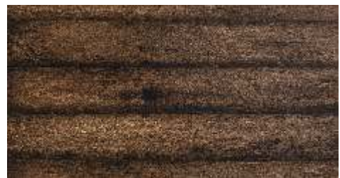
Ollie Wood (DD) Code: 3584