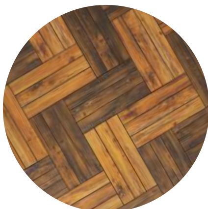
DIAGONAL TRIPLE PLANK HERRINGBONE - WEAVE ( 3090, 3092 )