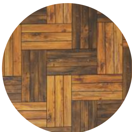
HERRINGBONE -3P WEAVE ( 3090, 3092 )