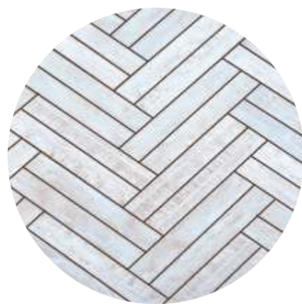
DIAGONAL DOUBLE PLANK HERRINGBONE ( 3580, 3573 )