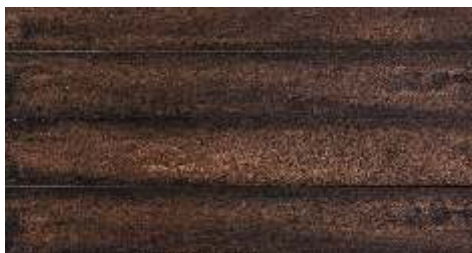
Havana Wood (DD) Code: 3583