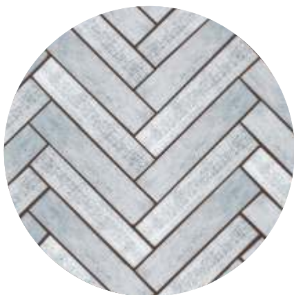
DIAGONAL SINGLE PLANK ( 3580, 3573 ) HERRINGBONE