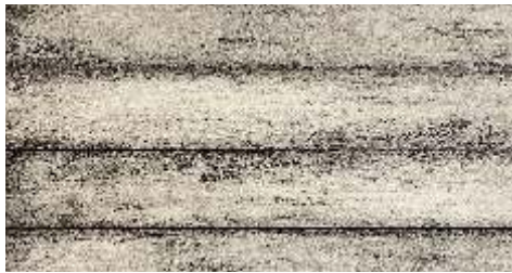
Bleached Walnut (DD) Code: 3581

French Bleed is a beautiful staining technique intended to give the look of aged wood with dark, contrasting edges. This style works well in many décors but is often blended harmoniously with rustic & country cottage styles!