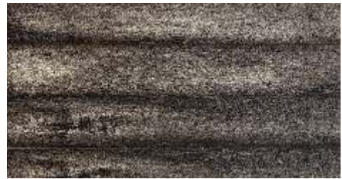
Silver Wood (DD) Code: 3582