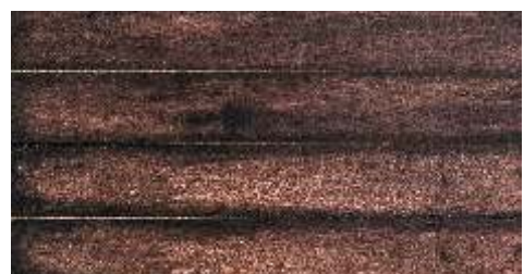
Brandy (DD) Code: 3586