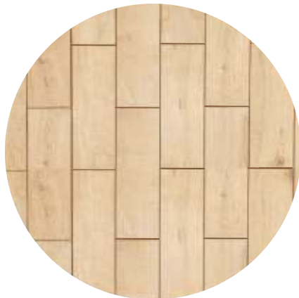
BRICK - V ( 3578 )