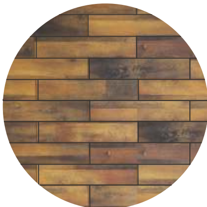
BRICK - H ( 3579 )